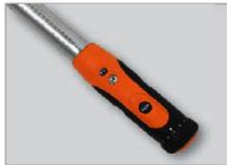
USE MODE Adjustment Ring in locked position