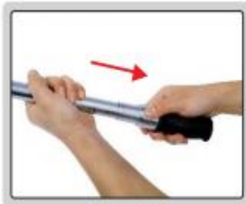
step 1: unlock