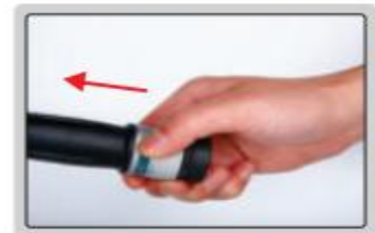
step 3: lock