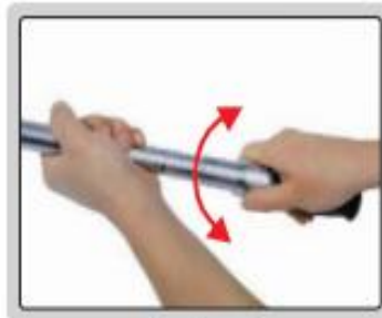
step 2: set