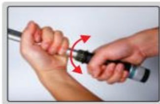
step 2: set