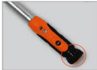
SET MODE Adjustment Ring in unlocked position for setting Torque value

Tightening achieved in clockwise direction with a click sound once the required torque is achieved. Reversing the ratchet allows for using the wrench in anti clockwise direction, used to loosen an over tightened fastener