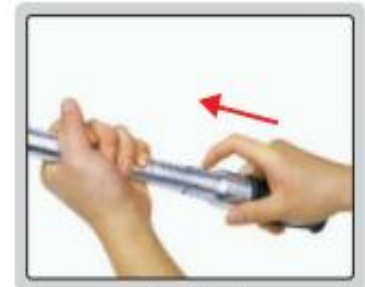
step 3: lock