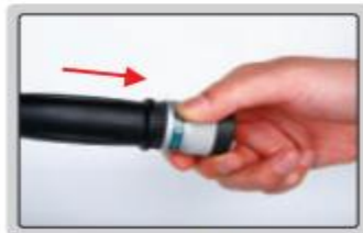
step 1: unlock