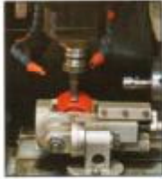
Universal Vice being used for boring applications on a Vertical Milling Machine