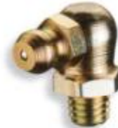
Angled Grease Fitting - 90°