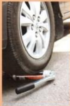
Drop & Impact Resistant, Crush Proof Barrel