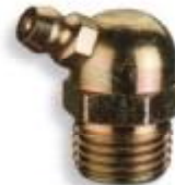
Angled Grease Fitting - 45°