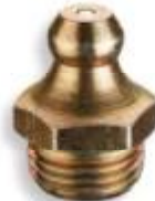
Grease Fitting - Straight