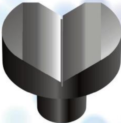
VEE GROOVE TABLE