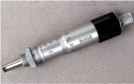
Micrometer Head with threaded diameter