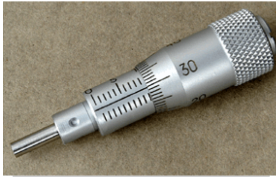
Micrometer Head range 0 - 18 mm