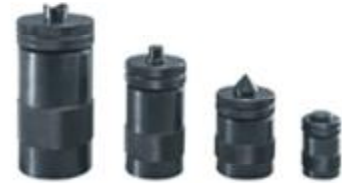
Leveling Screw Jack-Steel Body