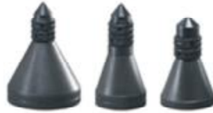
Leveling Screw Jack-CI