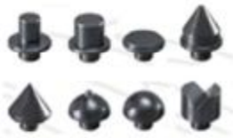
Leveling Screw Jack-Pad